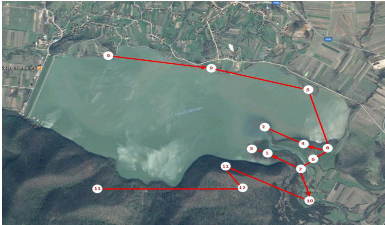
Fig. 2. Habitats inside and neighbouring the Lake Călinești Oaș