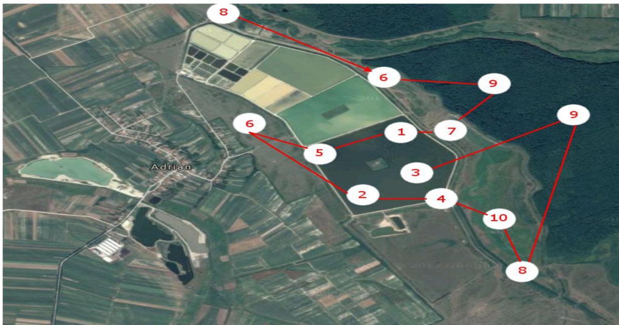
Fig. 3. Habitats inside and neighbouring the fish complex of Adrian